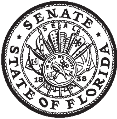
The Florida Senate